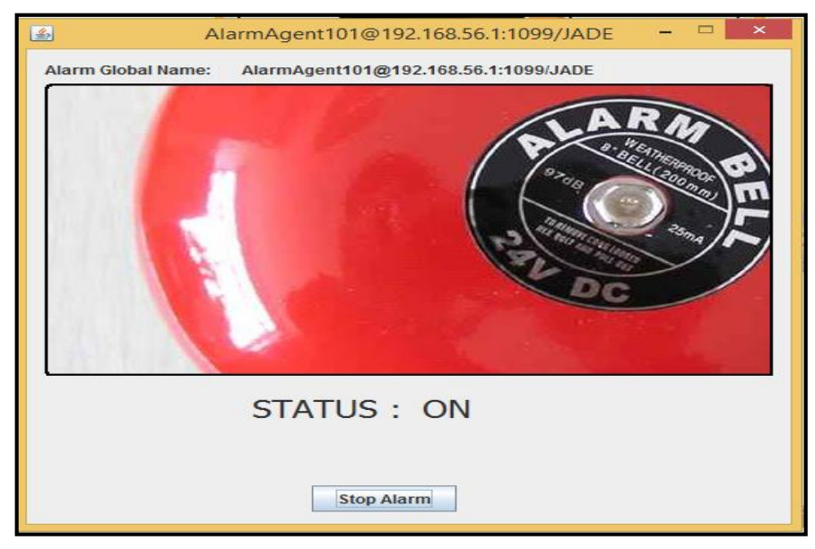
Figure 4: Alarm Agent

Figure 4 shows the Alarm Agent connected to the Facility Manager agent and receives ON and OFF trigger from the Facility Manager Agent. It gives an Alarm sound when ON.