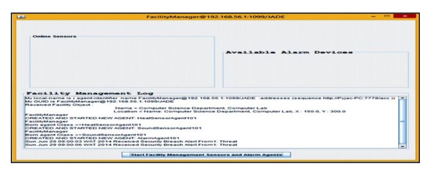
Figure 1: Security System Agent

The output is designed to be an interactive screen design and aids future change. It presents information to system users and most visible component of a working system. These outputs are produced from data that is either retrieved from database or, more often, input by users. Figure 1 below shows the Security System Agent which is the main agent that must boot up first before any other agent is booted. It is the central agent that handles threat resolving and facility registration as well as identification.