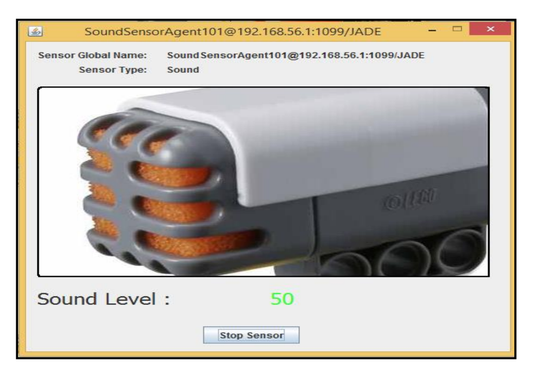
Figure 6: Sound Sensor Agent